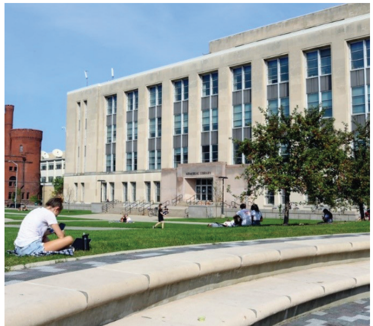
Memorial Library, the largest library on campus

For UW-Madison Libraries, the shift to a more encompassing approach to resource sharing is also perfectly aligned with their mission of expanding the impact of education on people's lives beyond the boundaries of the classroom.