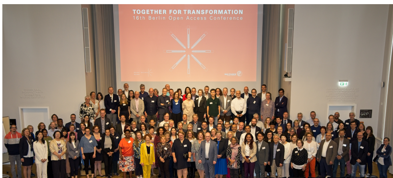
Participants of the 16 th Berlin Open Access Conference.