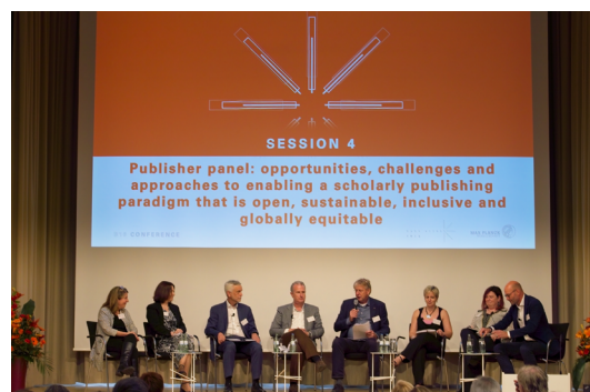
Publisher panel featured leadership representatives of publishing houses Elsevier, American Physical Society, Frontiers, Wiley, Cambridge University Press, PLOS and Springer Nature.

The publisher leadership panelists were invited to share their perspectives on the state of the art in the open access transformation in scholarly publishing, and, looking forward to the medium-term, thoughts on the opportunities and challenges of delivering optimal services to authors, in support of a scholarly communication paradigm that is open, transparent, sustainable, inclusive and globally equitable. Among the key issues highlighted in their opening statements were concerns around the 'green road' based on immediate deposit of accepted manuscripts, which relies on the continuation of the subscription-based system in journal publishing and, consequently, undermines the transformation to a fully open paradigm; the complexity of the current ecosystem in which research communities are at different stages of readiness for embracing an open scholarly publishing paradigm; and the importance of collaboration to leverage the full potential of all actors in the ecosystem and foster a healthy diversity of open publishing venues.