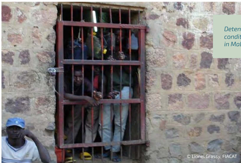
Detention conditions in Mali