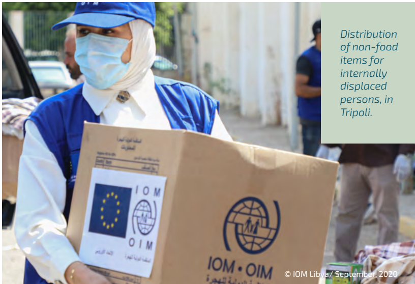
Distribution of non-food items for internally displaced persons, in Tripoli.

Since its establishment in 2014, the EU Regional Trust Fund in response to the Syrian crisis (the 'Madad' Fund) has reached EUR 2.2 billion. It covers programmes on education, livelihoods, health, socioeconomic support, water and waste infrastructure – benefiting both refugees and their host communities. More than EUR 2 billion of this fund was allocated to more than 90 projects to the Trust Fund's implementing partners on the ground, now reaching more than 7 million beneficiaries.