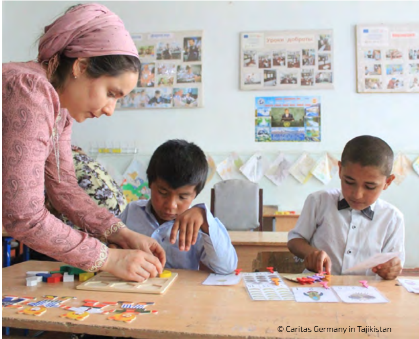
Children with disabilities have been involved in an inclusive education, Shahriz district in Tajikistan.

spaces, psychosocial support, the prevention of and response to violence, support for unaccompanied and separated children or to children associated with armed forces and groups.