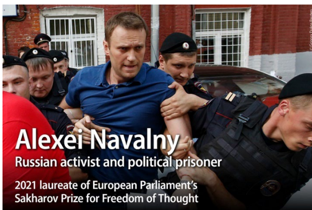
Alexei Navalny Russian activist and political prisoner 2021 laureate of European Parliament's Sakharov Prize for Freedom of Thought

Opposition political activist and anti-corruption campaigner Alexey Navalny was awarded in 2021 in recognition of his courageous fight against corruption, for human rights and democracy in Russia. His daughter Yulia Navalnaya and his Chief of Staff Leonid Volkov came to Parliament on his behalf. Navalny died in prison the following year, paying the ultimate price for his fight.