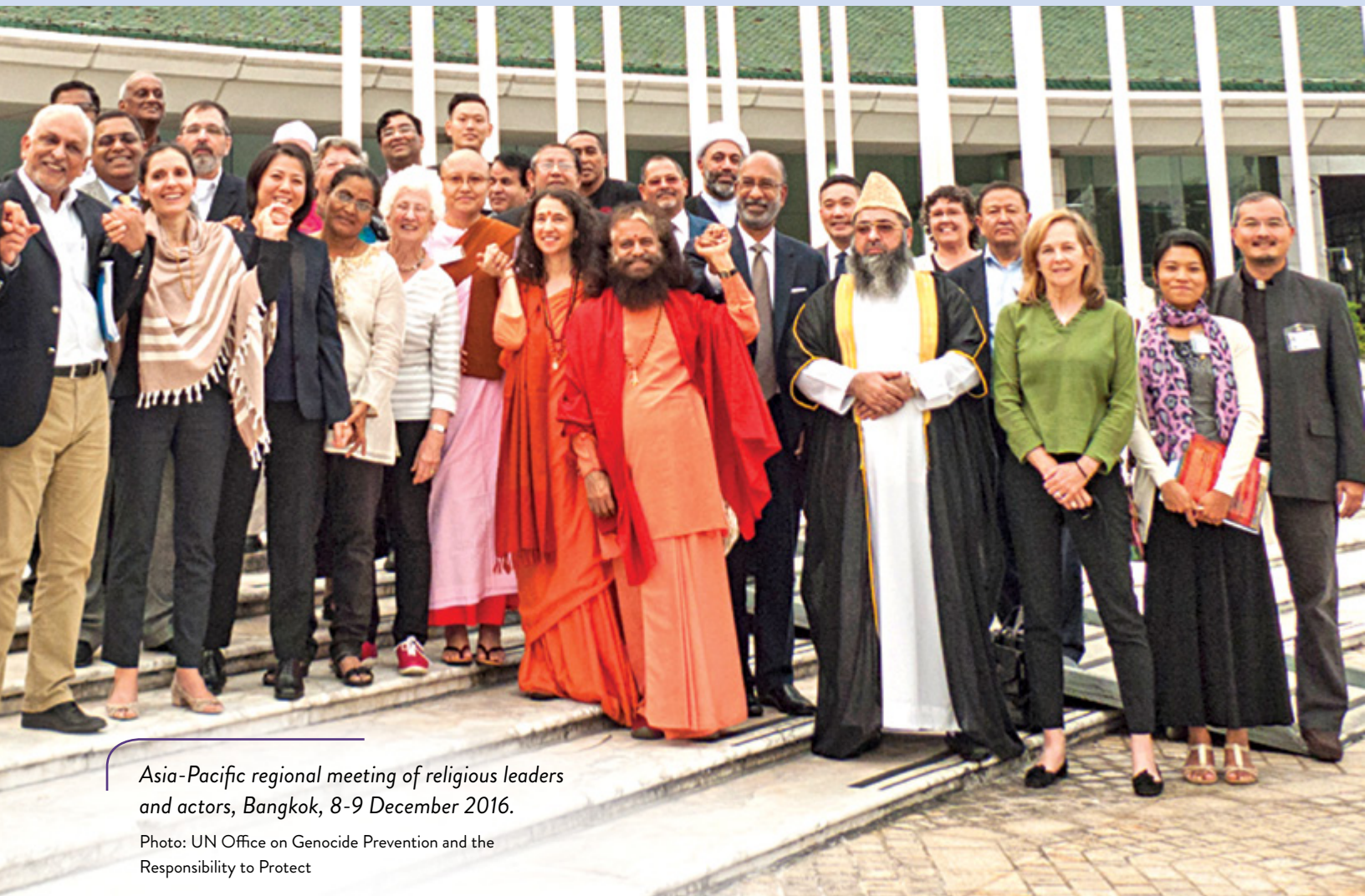
Asia-Pacific regional meeting of religious leaders and actors, Bangkok, 8-9 December 2016.

of religion, such as early or forced marriage and sexual slavery. Members of the network/coalition should keep each other informed about any measure taken to prevent, counter and respond to instances of incitement; initiate joint statements/responses; and coordinate actions, including through social media.