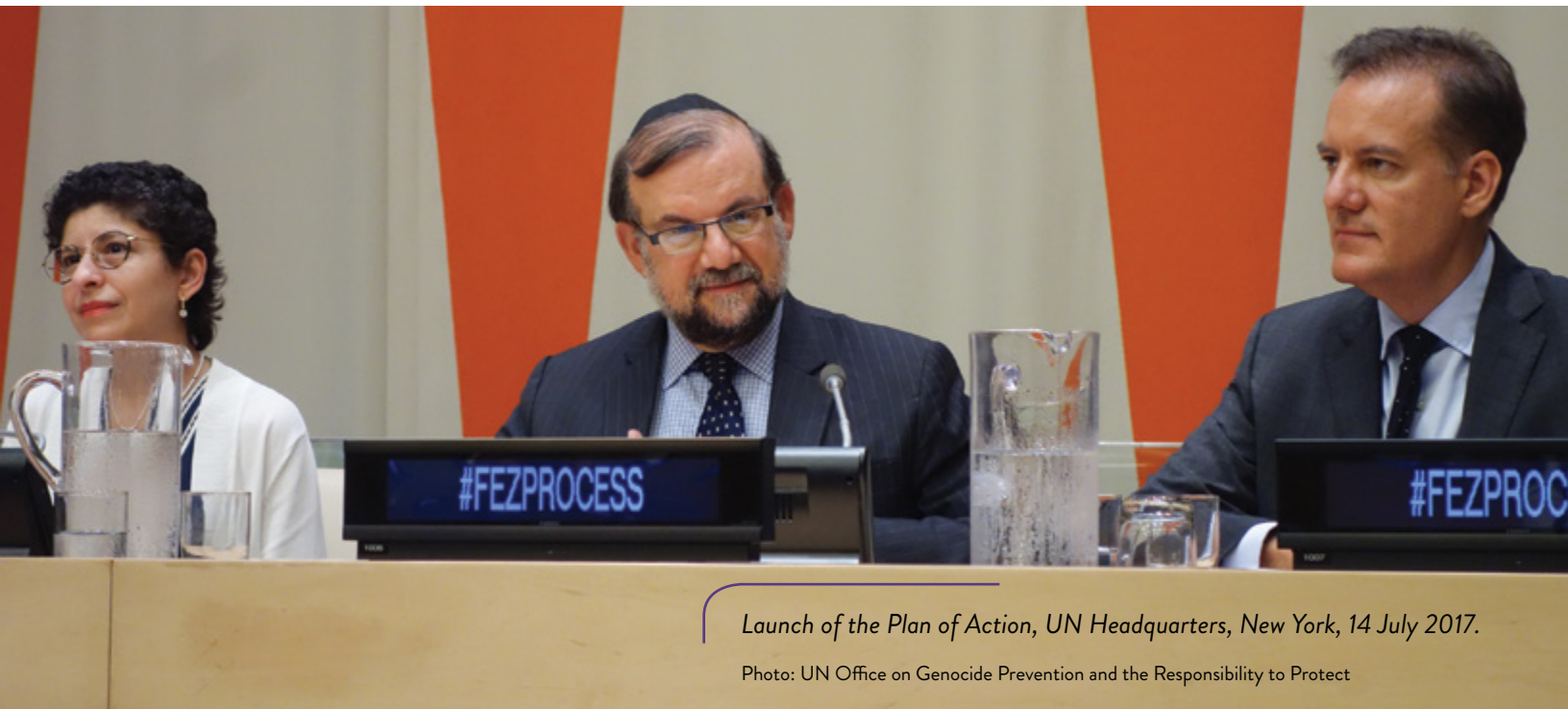
Launch of the Plan of Action, UN Headquarters, New York, 14 July 2017.