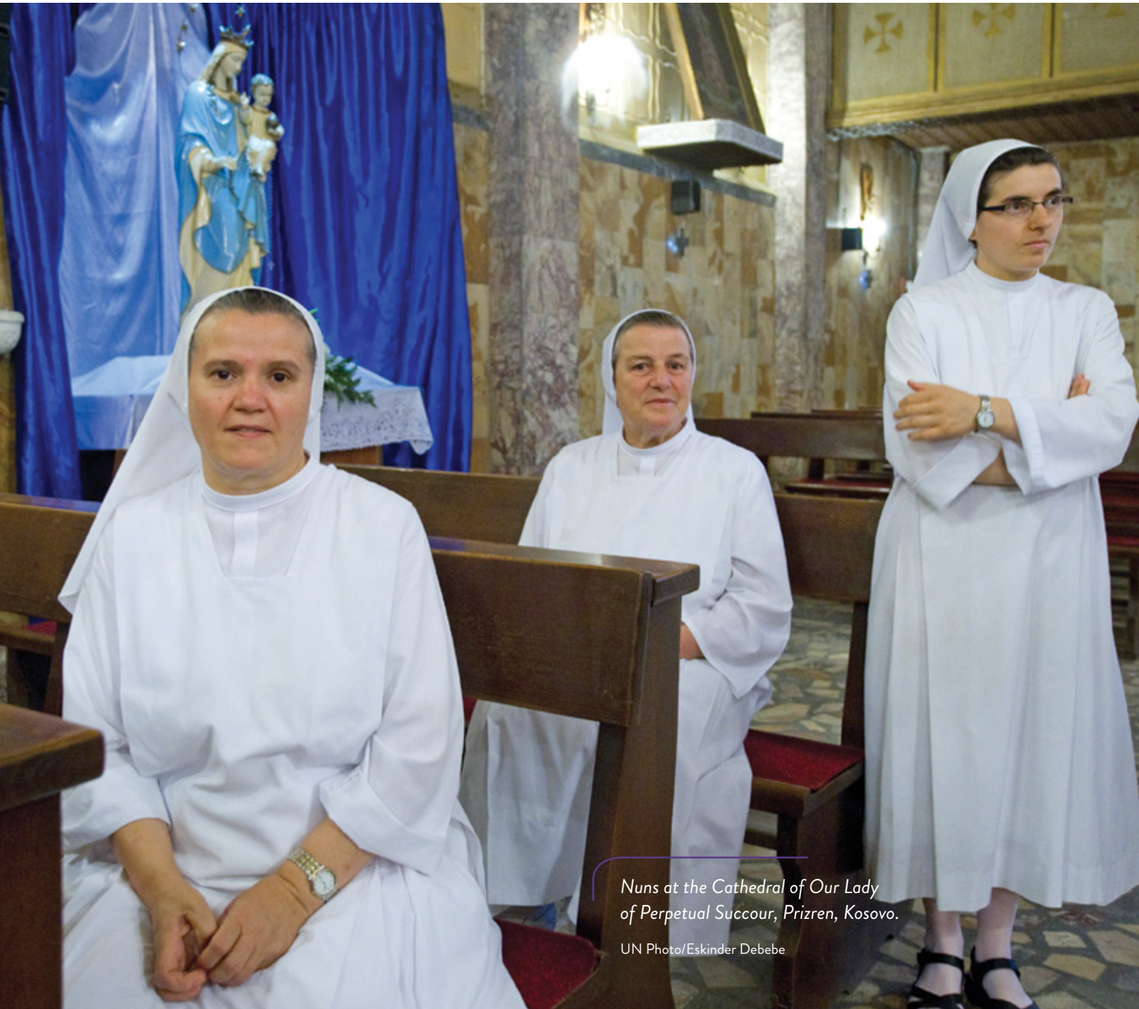
Nuns at the Cathedral of Our Lady of Perpetual Succour, Prizren, Kosovo.

Religious leaders and actors can be strong partners in the prevention of atrocity crimes and their incitement and, for this reason, national, regional and international institutions, civil society and the media should engage and cooperate with religious leaders in the context of efforts to prevent atrocity crimes.