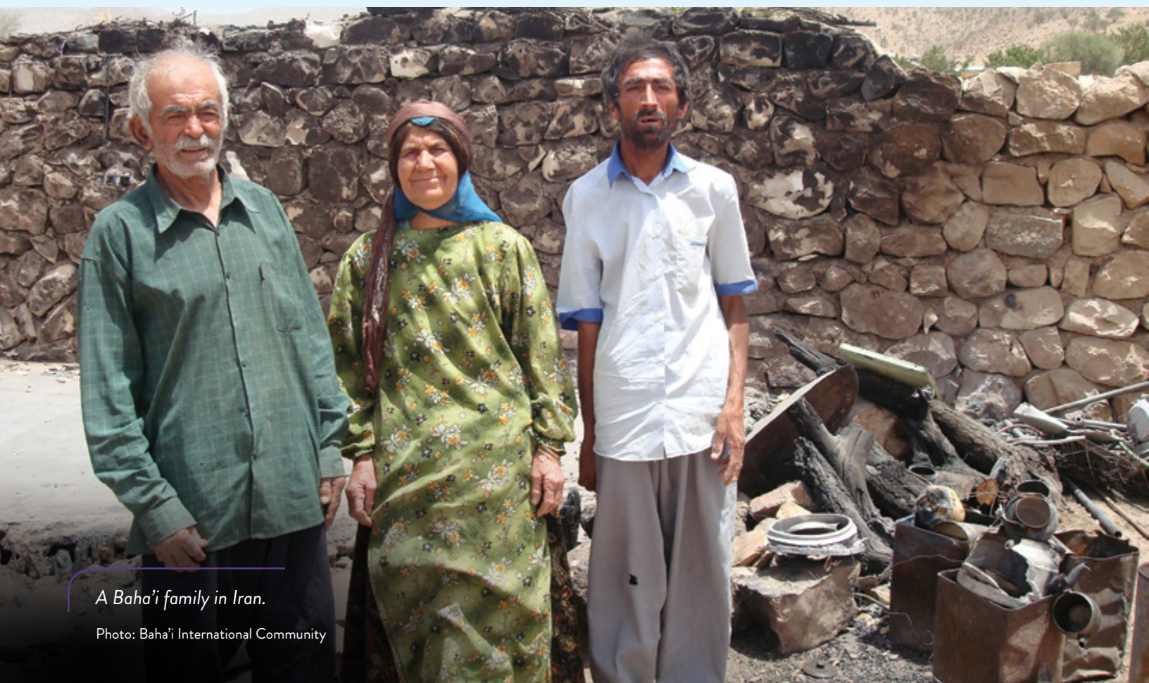
A Baha'i family in Iran.