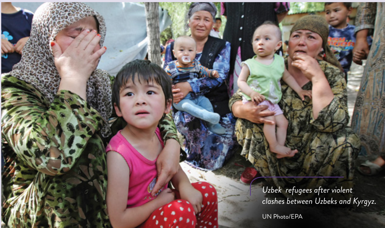
Uzbek refugees after violent clashes between Uzbeks and Kyrgyz.