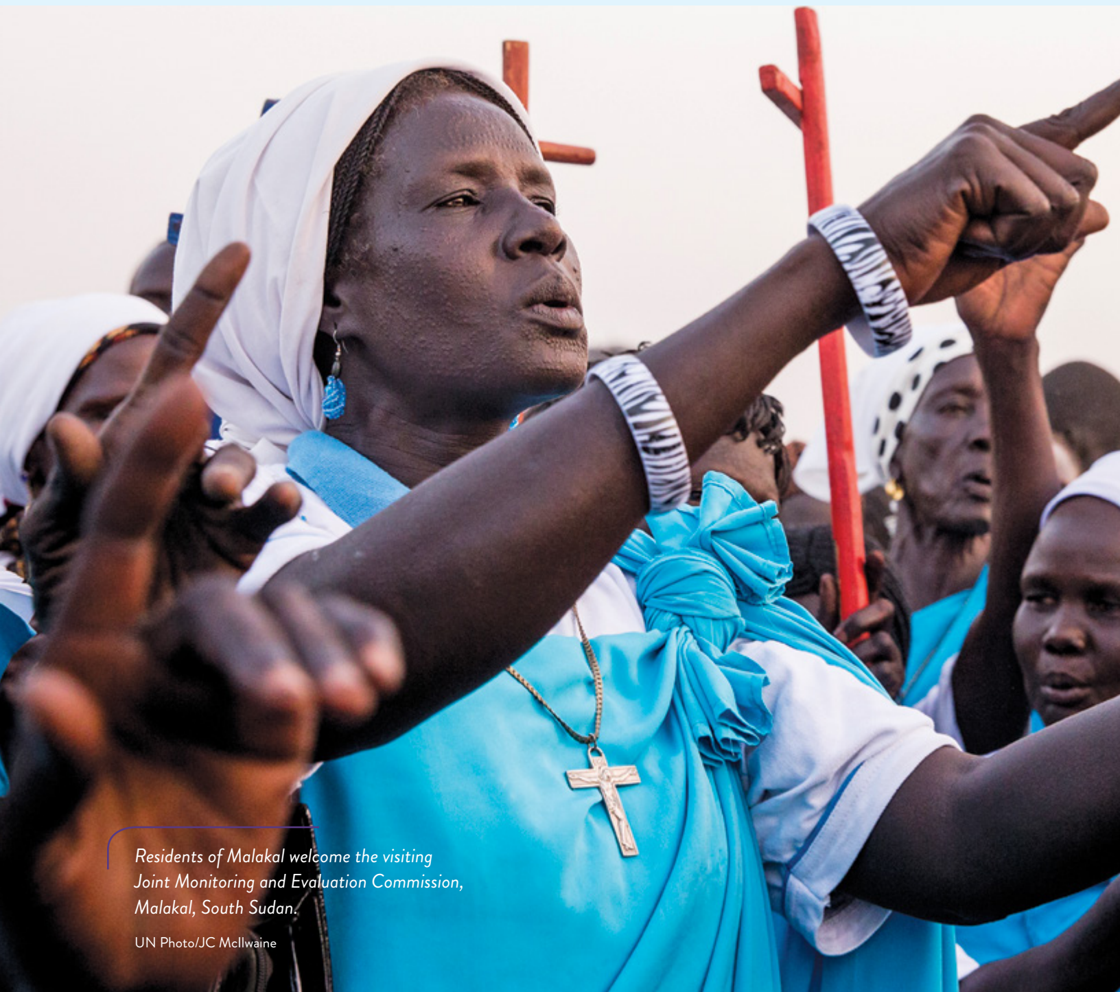
Residents of Malakal welcome the visiting Joint Monitoring and Evaluation Commission, Malakal, South Sudan.