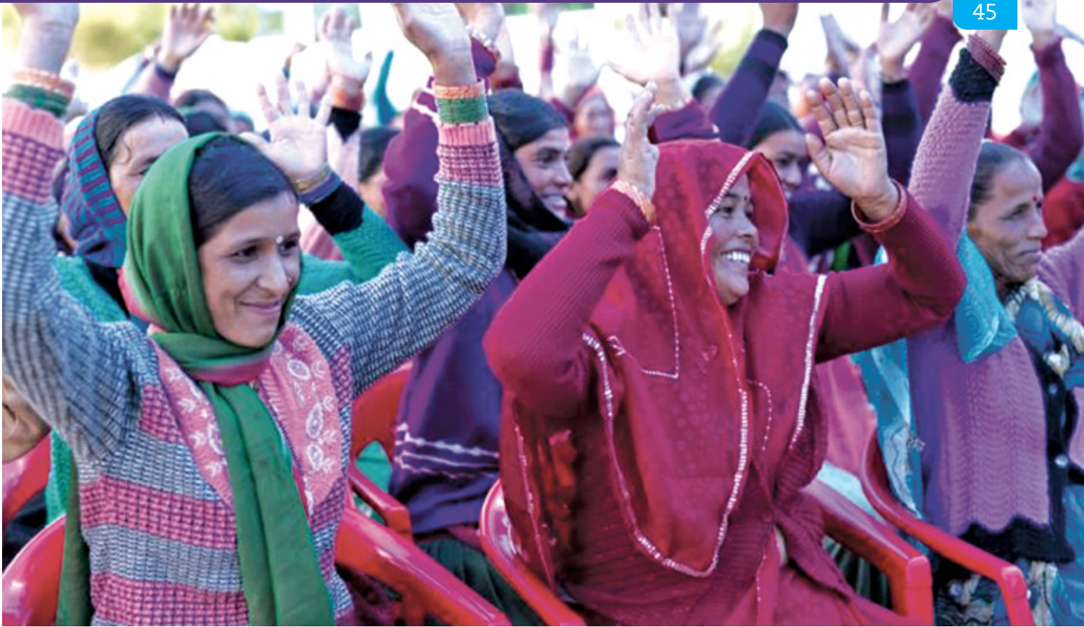
Hindu women at the Triyuginarayan Centre, India.