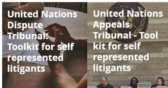
A toolkit for self-represented litigants is available for both the United Nations Dispute Tribunal and United Nations Appeals Tribunal .

Timeline: An application to the United Nations Dispute Tribunal must be filed within 90 calendar days of receipt of the management evaluation outcome or – if you have not received a response – within 90 calendar days from the moment the management evaluation outcome was due (which is within 30 days from the day you submitted your request if you work at New York Headquarters, or 45 days, if you work at an office away from Headquarters). In cases where management evaluation is not required, the application should be filed within 90 calendar days of when you were notified of the decision. If you have sought mediation through the Mediation Division of UNOMS, you have to file the application within 90 calendar days from the day the mediation ended unsuccessfully.