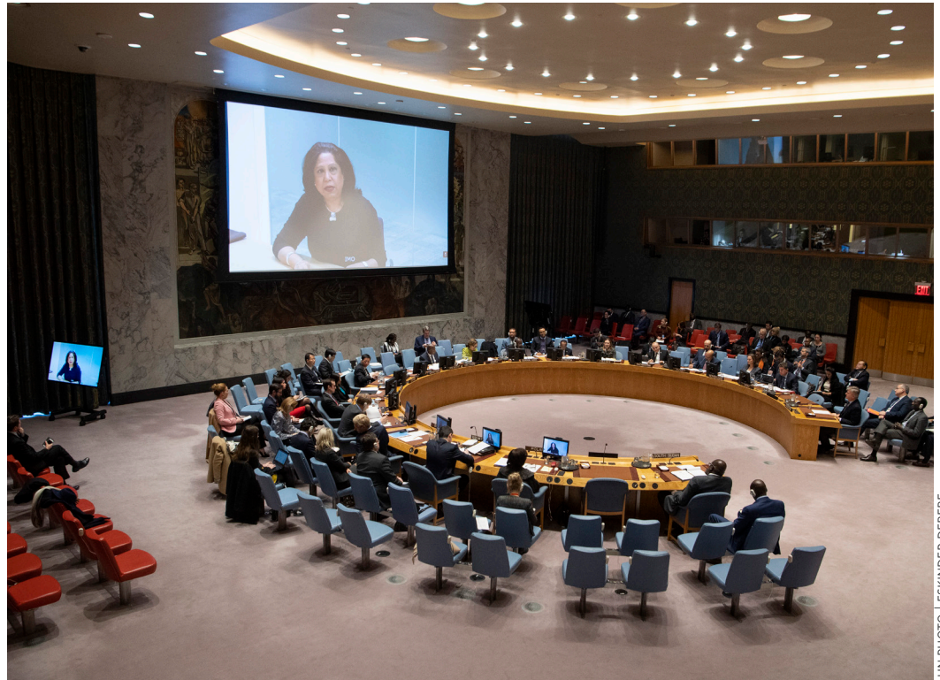
SRSR Pramila Patten briefing the Security Council on South Sudan in December 2018.

In resolution 2331 (2016), the Security Council “takes note with appreciation of the efforts undertaken by the Special Representative on Sexual Violence in Conflict and the Team of Experts on Rule of Law and Sexual Violence in Conflict to strengthen monitoring and analysis of sexual violence in conflict, including when associated with trafficking in persons in armed conflict and post-conflict situations, used as a tactic of war and also as a tactic by certain terrorist groups”.