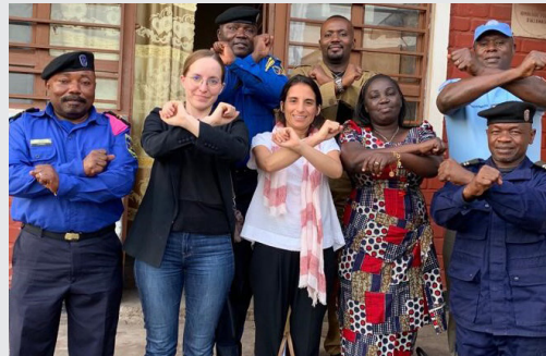
THE TEAM OF EXPERTS WITH THE POLICE IN GOMA DRC.

sexual violence (CRSV) signed on 31 May 2019 between the UN and CAR.