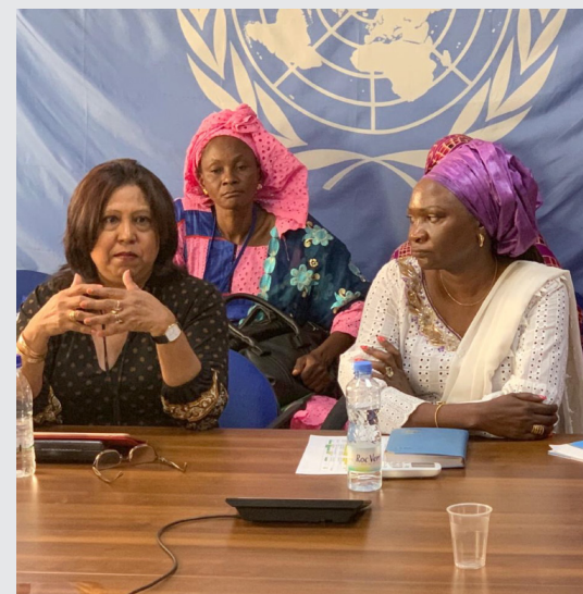
THE SRS-G-SVC ON MISSION IN MALI.