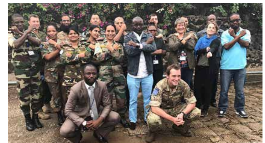
Photo Team of Experts