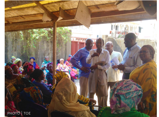
PHOTO | TOE The Team of Experts facilitated experience-sharing between Panzi Hospital of the DRC and the Guinean Ministry of Health to treat a group of survivors of the events of 28 September 2009.

international criminal law; human rights; policing and law enforcement; rule of law reform; reparations; transitional justice; and gender equality and non-discrimination.