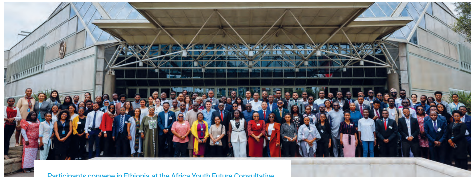
Participants convene in Ethiopia at the Africa Youth Future Consultative Forum on the Summit of the Future.

To foster a prosperous and more integrated African economy, we brought policymakers, experts and key stakeholders together through the Africa Dialogue Series. Focused on the African Continental Free Trade Area initiative, we supported progress on better trade regulations, increasing intra-African trade and harnessing the power of women entrepreneurs.