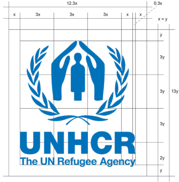
UNHCR Vertical Visibility logo