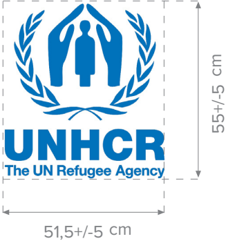
Size of the UNHCR Visibility logo on the tarpaulin